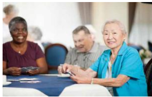
Multicultural Aged Care

the Australian Government is committed to ensuring equitable access to high quality, culturally appropriate aged care for people from CALD backgrounds