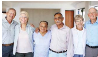
Multicultural Aged Care

people from CALD backgrounds are a significant and growing proportion of the Australian population aged over 65