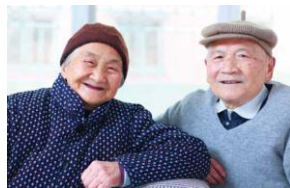
Multicultural Aged Care

around 20 per cent of people aged over 65 years were born outside Australia which equates to more than 600,000 people