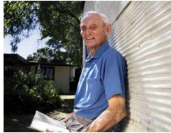
Multicultural Aged Care

the Strategic goals and actions are the tangible outcomes that DoHA will achieve from 2012-2017